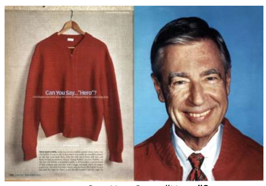
Can You Say..."Hero"? Fred Rogers has been doing the same small good thing for a very long time November 1 1998 TOM JUNOD

Once upon a time, a little boy loved a stuffed animal whose name was Old Rabbit. It was so old, in fact, that it was really an unstuffed animal; so old that even back then, with the little boy's brain still nice and fresh, he had no memory of it as "Young Rabbit," or even "Rabbit"; so old that Old Rabbit was barely a rabbit at all but rather a greasy hunk of skin without eyes and ears, with a single red stitch where its tongue used to be. The little boy didn't know why he loved Old Rabbit; he just did, and the night he threw it out the car window was the night he learned how to pray. He would grow up to become a great prayer, this little boy, but only intermittently, only fitfully, praying only when fear and desperation drove him to it, and the night he threw Old Rabbit into the darkness was the night that set the pattern, the night that taught him how. He prayed for Old Rabbit's safe return, and when, hours later, his mother and father came home with the filthy, precious strip of rabbity roadkill, he learned not only that prayers are sometimes answered but also the kind of severe effort they entail, the kind of endless frantic summoning. And so when he threw Old Rabbit out the car window the next time , it was gone for good.